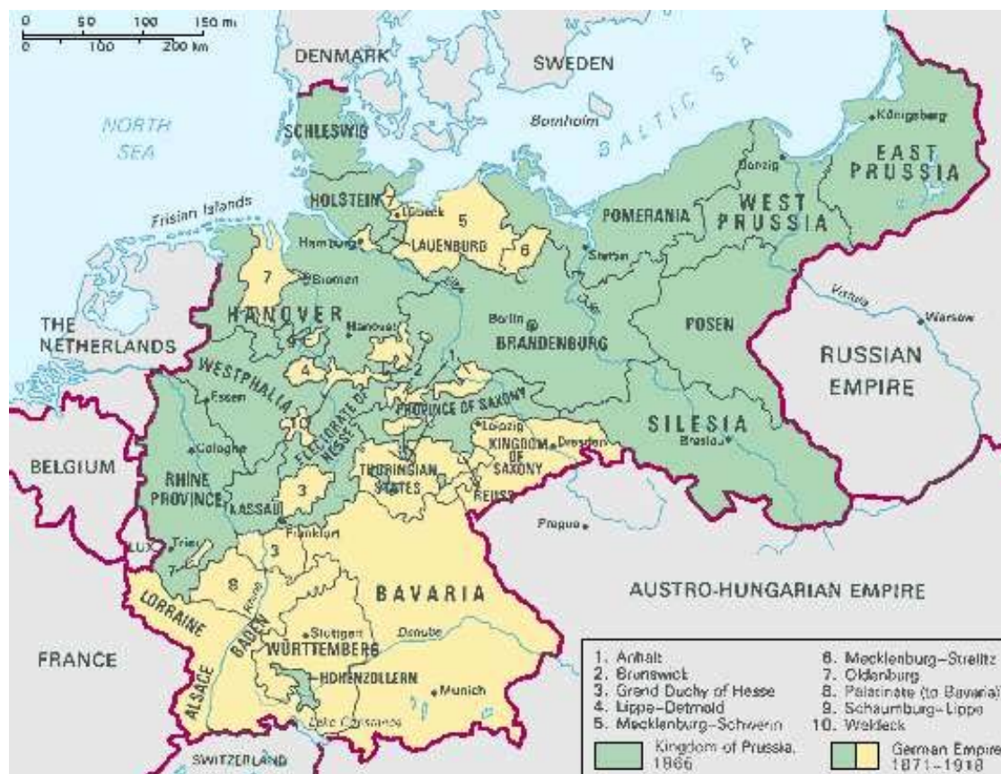
Figure 1. Map of Prussia